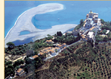
The Shrine of Our Lady of Tindari