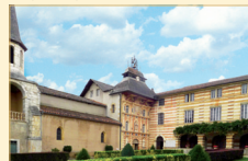
Exterior of the Shrine. The buildings around it have been transformed into a boarding school that holds almost 600 children