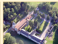
Panoramic view from above