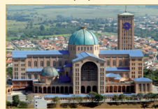
The Basilica of Our Lady of Aparecida is gigantic, the bell tower is 100 meters high, the dome is 70 meters in diameter, the nave is in the shape of a Greek cross—173 meters long by 105 meters wide—it is safe to say that with a total surface area of 18,000 square meters it has the capacity to hold more than 46 million worshippers. Pope John Paul II gave it the title of a Minor Basilica in 1980