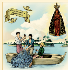
Drawing of the miracle of the big catch and the appearance of the little statue of Our Lady of Aparecida