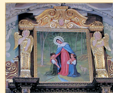
Interior of the Shrine