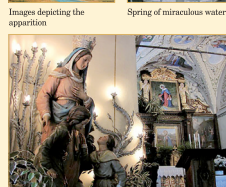
Statue depicting the apparition