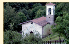
The small Shrine