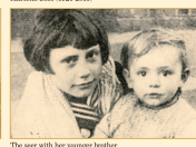
The sister with her younger brother