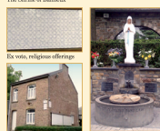
Banneux, view of the house of the sister