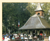
The Shrine of Banneux, near Liège, is visited each year by more than a million pilgrims