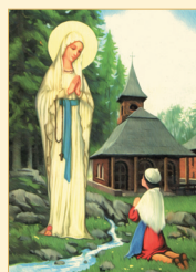
Duplications of the Apparition of the Blessed Mother