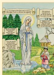
The Shrine of Banneux