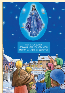
The visionaries, with their eyes turned towards the sky, see a Lady wearing a dark blue dress with large sleeves, a black veil on her head and a gold cross on her chest. Also her dress is like the sky, all studded with stars.