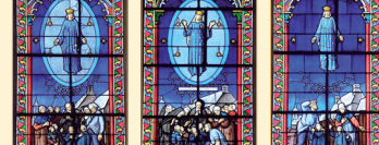
Stained glass windows illustrating the various moments of the apparition.