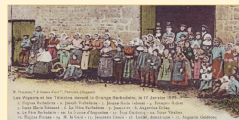
Visionaries and witnesses in front of the Barbedette's barn in 1871