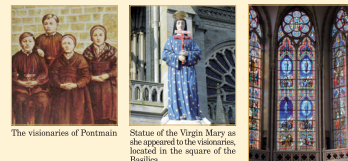
The visionaries of Pontmain. The statue of the Virgin Mary as she appeared to the visionaries, located in the square of the Basilica.