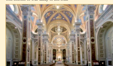
Interior of the Shrine