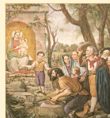
Paintings that depict the apparition