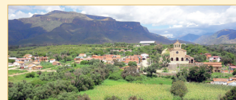
Panoramic view of the Shrine