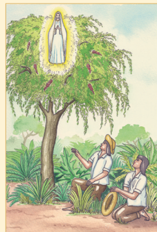
Image representing the apparition

In 1750 two shepherds returning from the pasture were lamenting about the severe drought that had struck those places, commenting that rain would have been the only salvation for the animals and the harvest. Suddenly, not very far from them, they saw a glow and thus they headed towards it. As they were approaching the rays of multicolored light became intertwined forming a marvelous vision from which soon emerged a statue of the Virgin Mary on top of a pepper tree, typical plant of the area. They took the statue and brought it home notifying everyone of the miraculous event. Upon arriving home they placed it on a niche to expose it to the veneration of all. They fell on their knees and kissed the ground exclaiming: "My Lady, thanks be to God!". The news soon spread and some people began to hasten to it but the two peasants realized that the statue had mysteriously disappeared from the niche. The following day, at the first light of dawn, they returned again to the place of the apparition and there they found again the image of Our Lady. A little later they were joined by a great number of people who also were witnesses of the miracle. Then it was decided to build immediately a small chapel in honor of the event. The miraculous statue, known by the name of Virgen de Chaguaya (Virgin of Chaguaya), became always more famous for the miracles that it performed. In 1980 the current Shrine was built around the old chapel, which by then had become too small to hold many people.