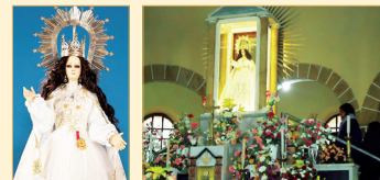
The devotion to Our Lady of Chaguaya is widespread in southwestern Bolivia and in northern Argentina