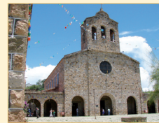
Shrine of Our Lady of Chaguaya