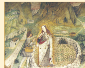
A fresco from 1513 that depicts the apparition in which the Virgin Mary herself points to the place where the church should be constructed.