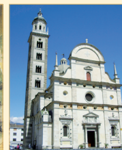
View of the shrine