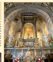
Inside the sanctuary