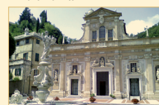
On July 12, 1536 the City Council of Savona approved the construction of a Shrine on the place of the apparition, with an adjoining home for the poor and sick