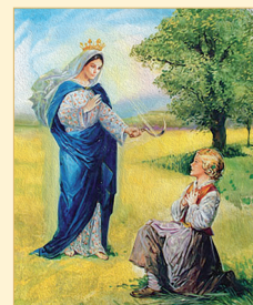
Painting depicting the apparition of the Virgin Mary