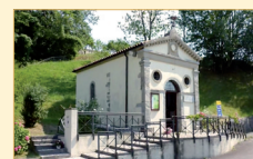
Small chapel built on the place where the apparition occurred