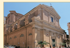
Church of Saint Andrew of the Thickets in Rome