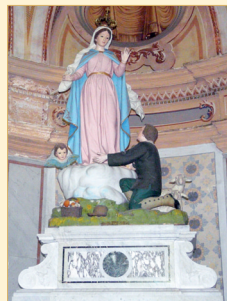
A complex wooden statue behind the main altar that recalls the moment of the apparition