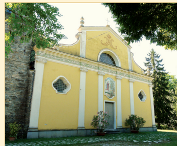
The Shrine of Our Lady of the Woodland