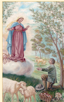
A fresco that depicts the apparition

The statue of Our Lady is carried in procession during the Feast of the Assumption and on the anniversary of the Name of Mary which is celebrated the first Sunday after September 8. The Feast of the Apparition is on May 19, a date that has deep roots in the profane rural festivals born in the 1400s. Outside the shrine, there is ample green space and a splendid fountain with flowing spring water.