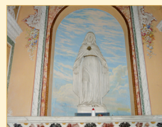
One of the statues dedicated to Our Lady