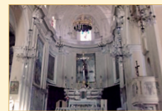
Inside the shrine