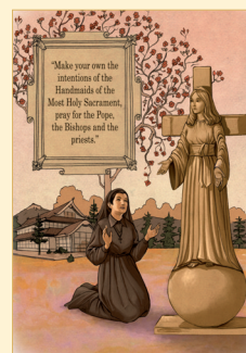
Depiction of the apparition