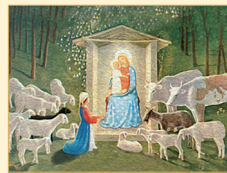
Painting depicting the apparition

The news of the extraordinary event quickly spread in the surroundings and the people transformed the small chapel into an actual Church in honor of the Nativity of the Blessed Virgin Mary. Two years later, on September 8, 1530, they began to celebrate the feast of Our Lady of the Boden. Numerous were the miracles and the graces performed by the Virgin of the Boden, among them there were also some apparitions. We recall, for example, the episode when the Virgin Mary appeared and saved young Alberto Maffioli, swept away by a terrible landslide of rocks. The image of Our Lady of the Boden was solemnly crowned for the first time in 1868 at the hands of the Bishop of Novara, the Most Rev. Giacomo Filippo Gentile, and a second time at the hands of the Most Rev. Giuseppe Gamba, later Bishop and then Cardinal of Turin.