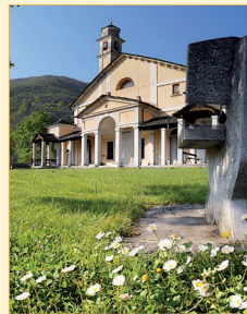
Shrine of Our Lady of the Boden