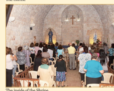
The inside of the Shrine