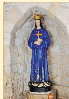
Our Lady of Bechwat