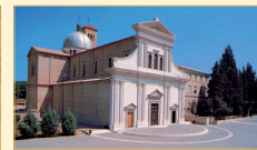
View of the Shrine