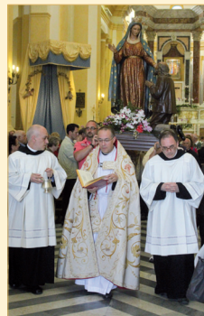
Interior of the Basilica