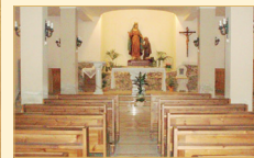
Interior of the Shrine