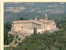
External view of the Shrine of Mount Senario