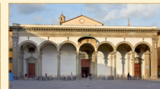
The Church of the Most Holy Annunciation in Florence, where the miraculous painting is preserved