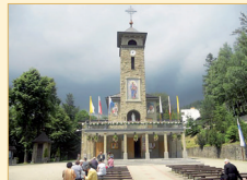
The Shrine of Our Lady of Szczyrk