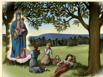
Picture depicting the apparition