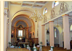
Inside the shrine