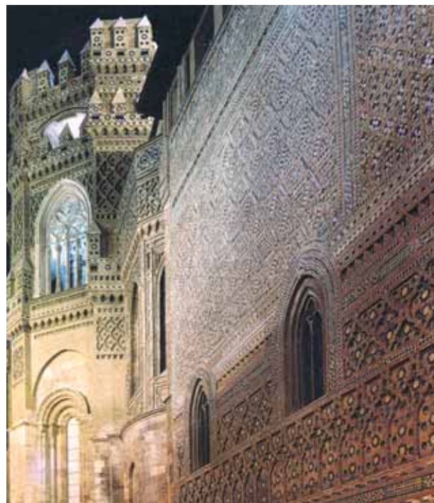
Exterior side of the Cathedral of the See