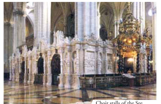
Choir stalls of the See