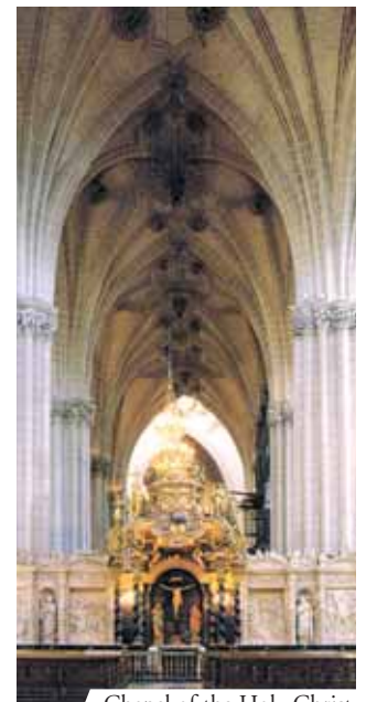
Chapel of the Holy Christ