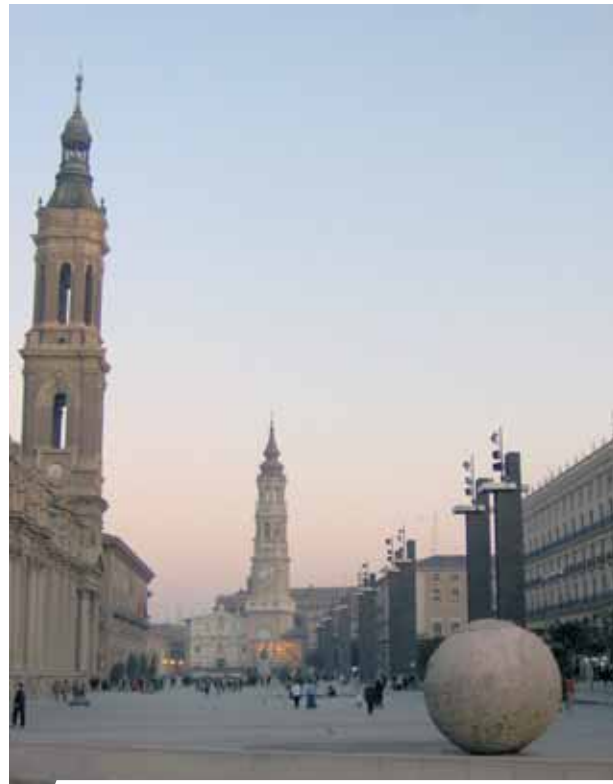
Cathedral of the See, Zaragoza

In the consecrated Host, stolen by a woman of Zaragoza to use in making a love potion, the Baby Jesus appeared. In the town hall archives of the city of Zaragoza is preserved the document that describes the miracle in detail. And in the cathedral, next to the chapel of “San Dominguito del Val” there is a painting accurately depicting the marvelous event.