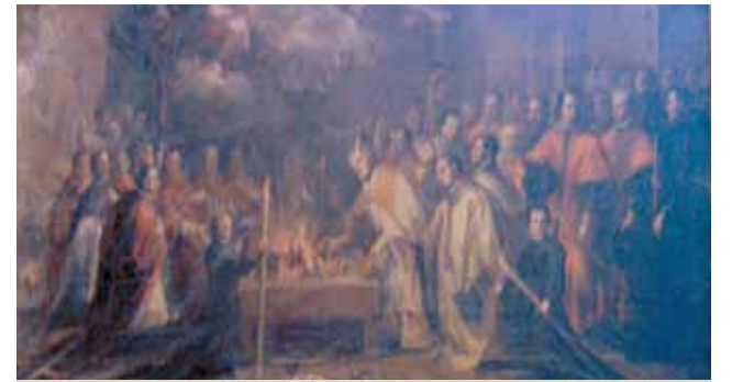
Ancient painting in the Cathedral of the See representing the miracle in the Chapel of Little Saint Dominic of the Val. There is also on the wall facing the chapel, a marble plaque describing the miracle