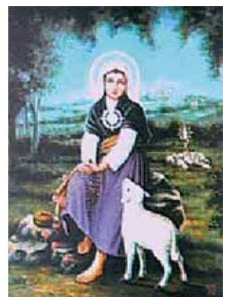
Print depicting the miracle of the unattended herd not ever being attacked by wild animals