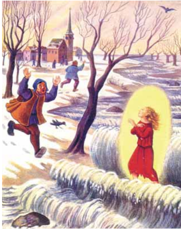
Antique painting in which the miracle is depicted

The Eucharistic miracle of Pibrac is about Saint Germaine Cousin (1579-1601). In order for St. Germaine Cousin to participate in the Holy Celebration of the Mass, she had to cross through a violent stream with extremely high waters; the waters divided in two and let her pass undisturbed.