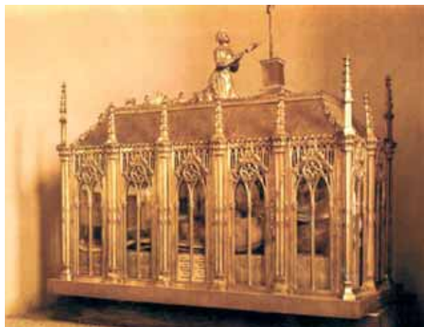
Tomb of St. Germaine