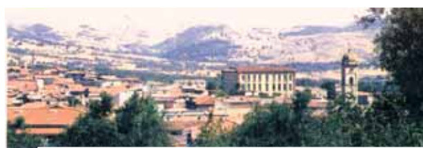
Panoramic view of Mogoro