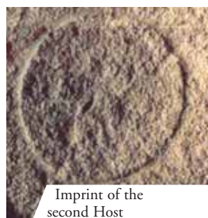
Imprint of the second Host