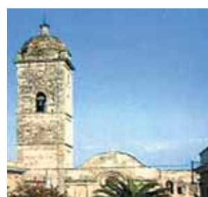
Parish of Saint Bernard, Mogoro