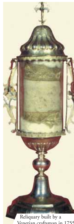
Reliquary built by a Venetian craftsman in 1755