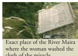
Exact place of the River Maira where the woman washed the cloth of the miracle