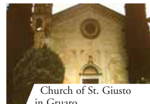
Church of St. Giusto in Gruaro