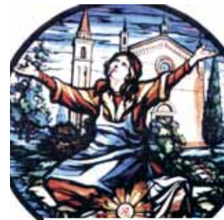
Church of Gruaro. Rose window depicting the miracle