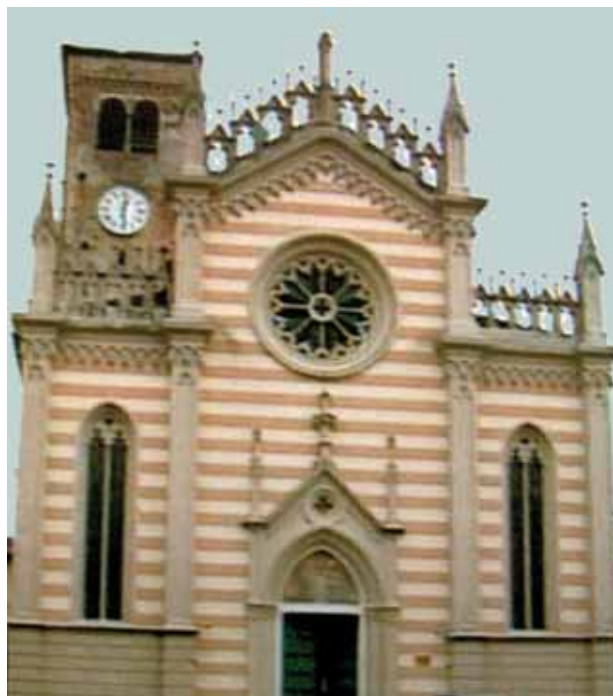
The Blood-stained linen cloth is kept in the Church of the Most Holy Body of Christ in Valvasone