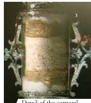
Detail of the corporal