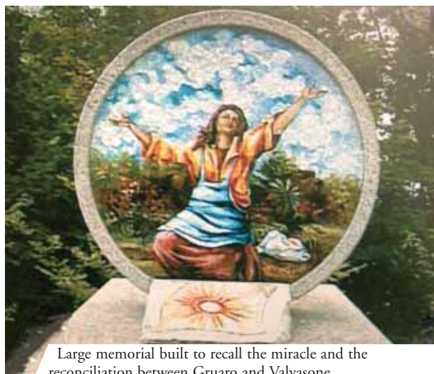
Large memorial built to recall the miracle and the reconciliation between Gruaro and Valvasone