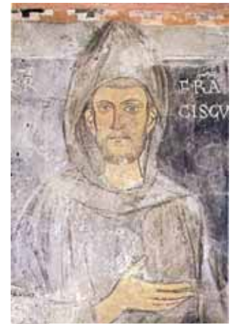
Portrait (Image) of Saint Francis, Speco