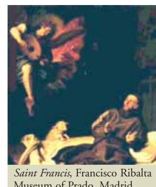
Saint Francis, Francisco Ribalta Museum of Prado, Madrid