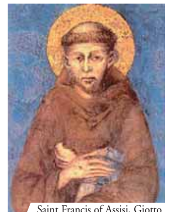
Saint Francis of Assisi, Giotto