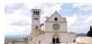
Upper Basilica of Saint Francis, Assisi