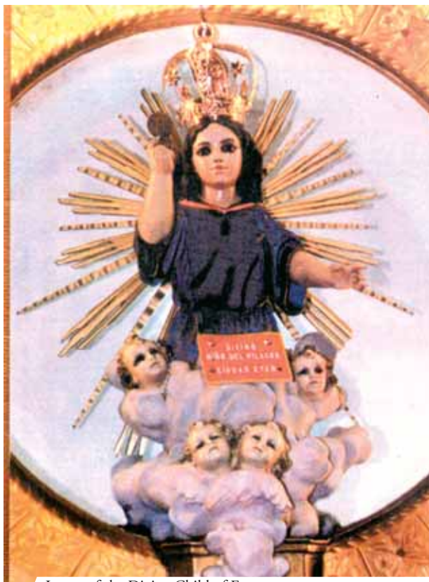
Image of the Divine Child of Eten

The Eucharistic miracle of Eten happened about 365 years ago in the Peruvian town of Port Eten. In a Host exposed for public adoration, there appeared the Child Jesus and three interconnected hearts of a brilliant white color. Every year, the feast in honor of this event begins on July 12, with the transfer of the Host of the miracle from its Sanctuary to the church in the City of Eten, and ends on July 24.