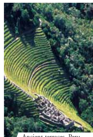
Ancient terraces, Peru