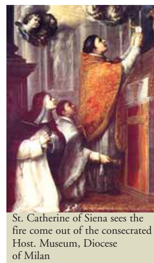
St. Catherine of Siena sees the fire come out of the consecrated Host. Museum, Diocese of Milan