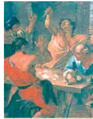
The Eucharistic Miracle at Brussels. Hieron Museum, Paray-le-Monial