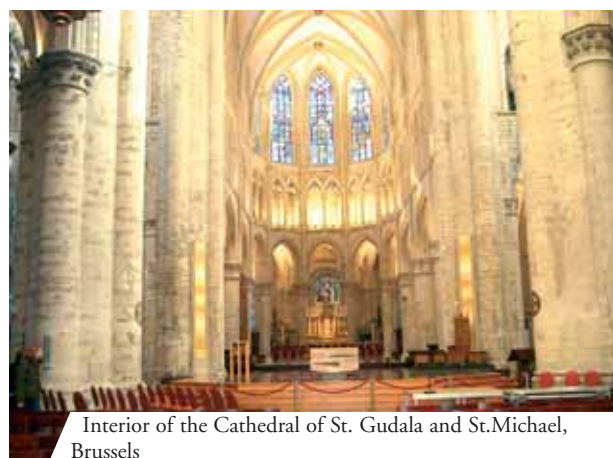
Interior of the Cathedral of St. Gudula and St. Michael, Brussels