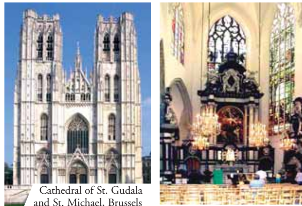
Cathedral of St. Gudula and St. Michael, Brussels