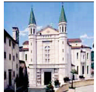
(2) Basilica of St. Rita