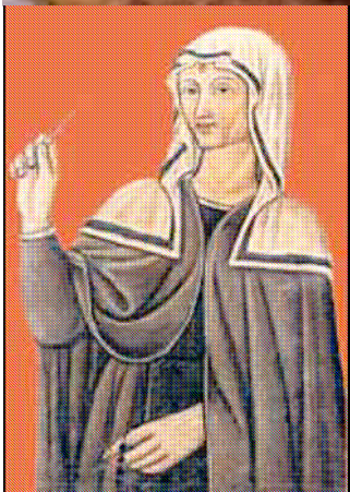
(1) The oldest image of St. Rita

Blood. Numerous Popes have promoted the devotion associated with this Miracle through the granting of indulgences.