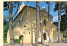
The small Abbey of Cotignac in Provence