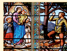
Stained glass window illustrating the apparition of Our Lady to the woodcutter Jean de la Baume