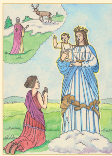
Depiction of the apparition