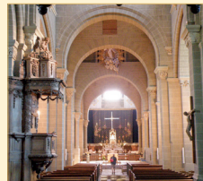
Inside of the Cathedral