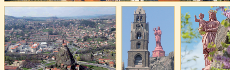
View of the city