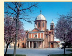
Outside of the great Shrine of the Virgin Mary in Cussanio