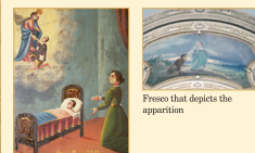
Ex voto - objects offered for graces received