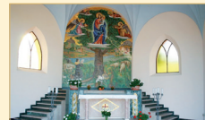
Internal view of the Chapel