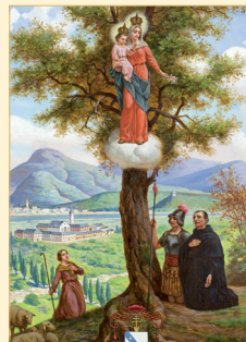
The devotion to Our Lady of the Oak Tree grows, favored also by interventions of the Popes. On the 12 of June 1962, Pope John XXIII, with the Papal Bull entitled "Luminis Stella" proclaims "the Blessed Virgin Mary of the Oak as Principal Celestial Patroness of the Nure Valley"

Next to the little church a convent is also built; both are entrusted to the Franciscan Friars of the Third Order Regular. Instead, the faith of the people is great and it gives us some true works of art, as in the beautiful golden Statue of wood of the 15th century, the Banner of the Shrine, and the antique carving of 1754 illustrating the apparition. As the times improved, a new Shrine was built and consecrated on the 31st of May 1885.