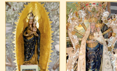
Statue of the Blessed Mother carved in golden wood of the 15th century