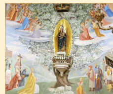
Process that depicts the apparition