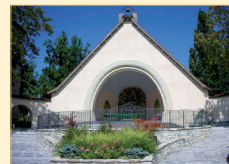
External view of the Chapel