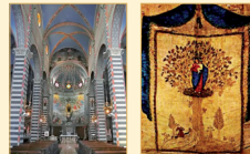
Internal view of the new Shrine