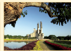
Shrine of Guanare