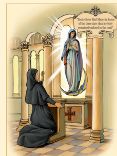
A picture depicting the apparition