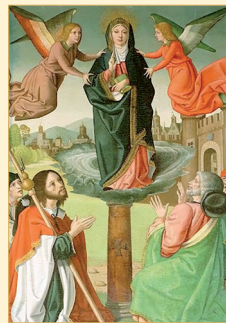
Representation of the first apparition of the Blessed Mother to Saint James