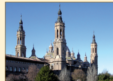
Photograph of the Basilica of Zaragoza