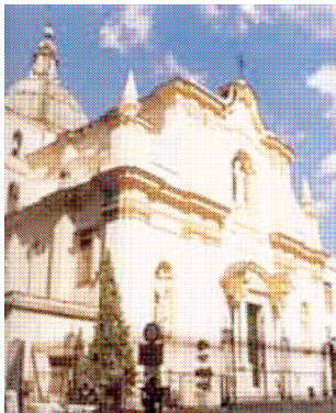
(1) Church of St. Peter, Patierno