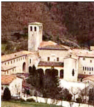
(1) The Hermitage of Fonte Avellana, where St. Peter Damian lived.

St. Peter Damian, Doctor of the Church, describes an important Eucharistic Miracle of which he was a direct witness in his work “Opusculum XXXIV, Patrologia Latina, vol. CXLV,col.573.” We record here in translation the episode as the Saint himself recounts it: “This is a Eucharistic event of great importance. It took place in 1050. A woman, giving into some abominable temptations, was about to take the Eucharistic Bread to her house to commit a sacrilege. However, a priest noticed what was happening, chased after her, and recovered the Host which the sacrilegious woman had stolen. At that point, when he unfolded the white linen in which the Sacred Host had been wrapped, noticed that it was transformed in such a way that half of the Host had become the Body of the Lord in a visible way, while the other half maintained the ordinary appearance of Bread. By such clear testimony, God wished to triumph over unbelief and heresy on the part of those who refused to accept the Real Presence in the Eucharistic Mystery: in half of the consecrated bread, the Body of the Lord was made visible, while the other half was left in its natural form, to better demonstrate the reality of sacramental transubstantiation on which takes place at the Consecration.”