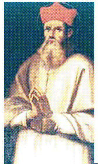
(2) St. Peter Damian