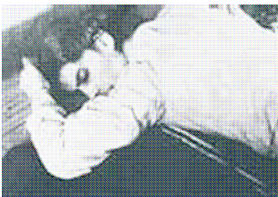
(3) Alexandrina likewise relived the sorrows of Jesus' Passion every Friday