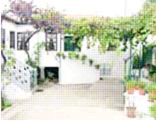
(1) The house of Alexandrina a Balasar